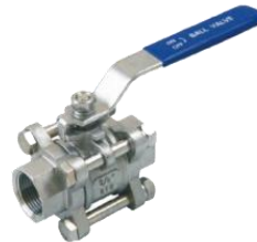
economy ball valve