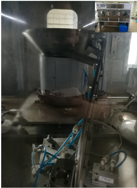
auto O-ring assembly machine↓