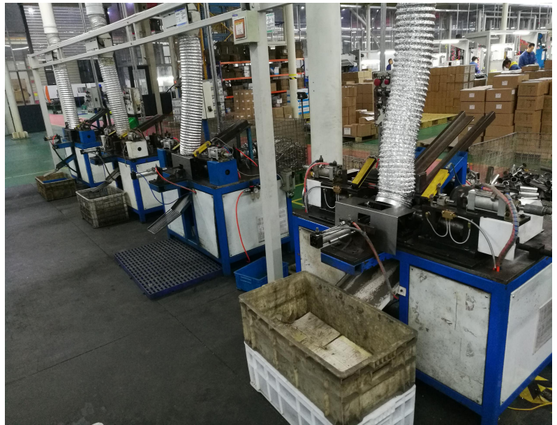
deburring and chamfering machine↓