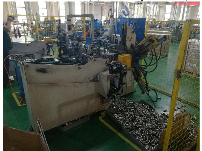
double heads auto pipe bending machine↓