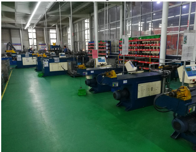
pipe bending machine↓