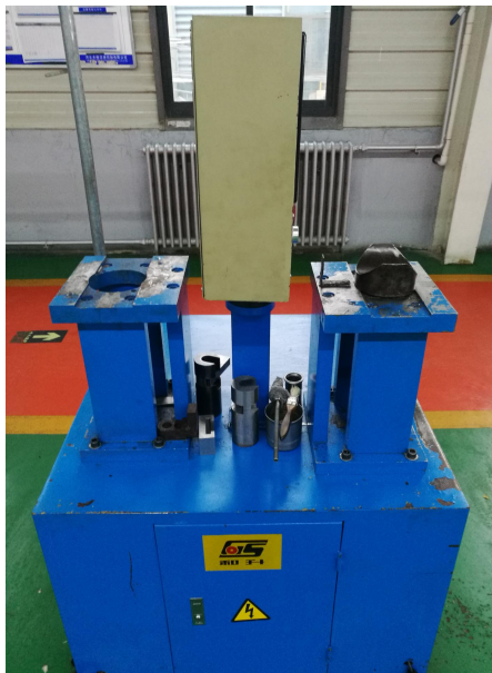
mouth pulling machine↓