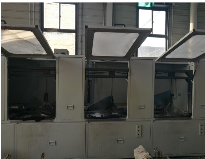
ultrasonic cleaning machine ↓