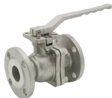
flange ball valve