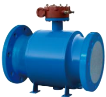
welded ball valve