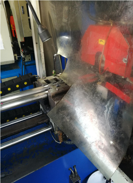
pipe cutting machine↓